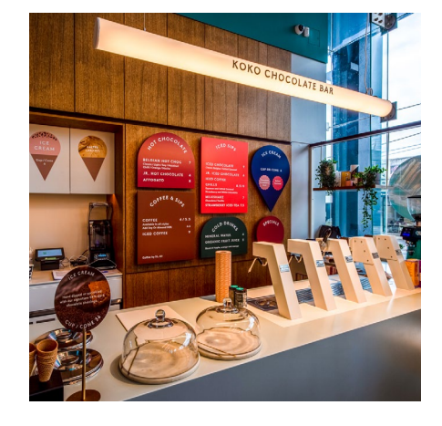
Koko Black, Como