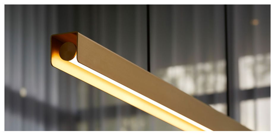
Crescendo custom pendant