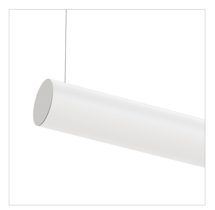
OBOE SUSPENDED Textured White with Opal Diffuser